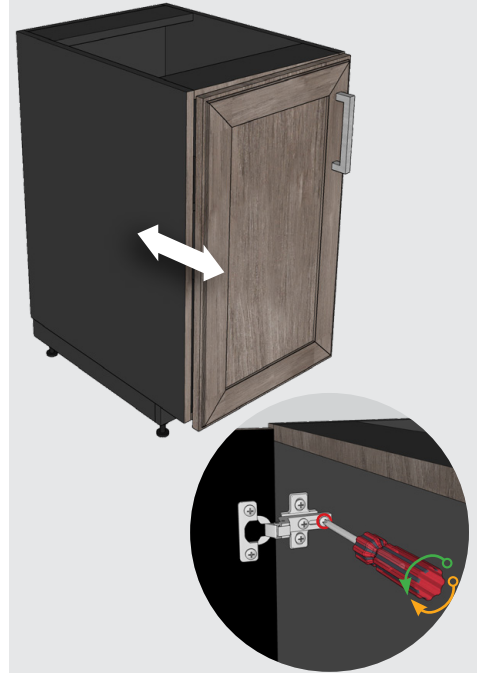
Depth adjustment (In - Out)

Loosen non-cam screw to adjust door gap (-0.1378", +0.0787") and re-tighten screw.