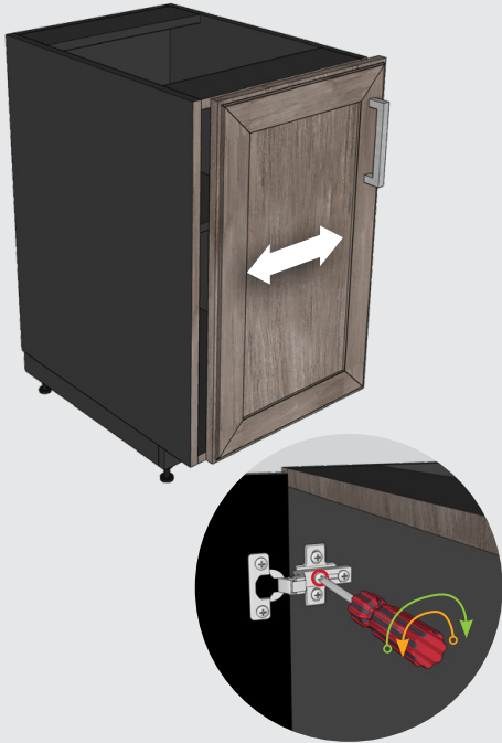
Side adjustment (Left - Right)

Rotate the front screw to increase or decrease door overlay (-0.0591", +0.1378").